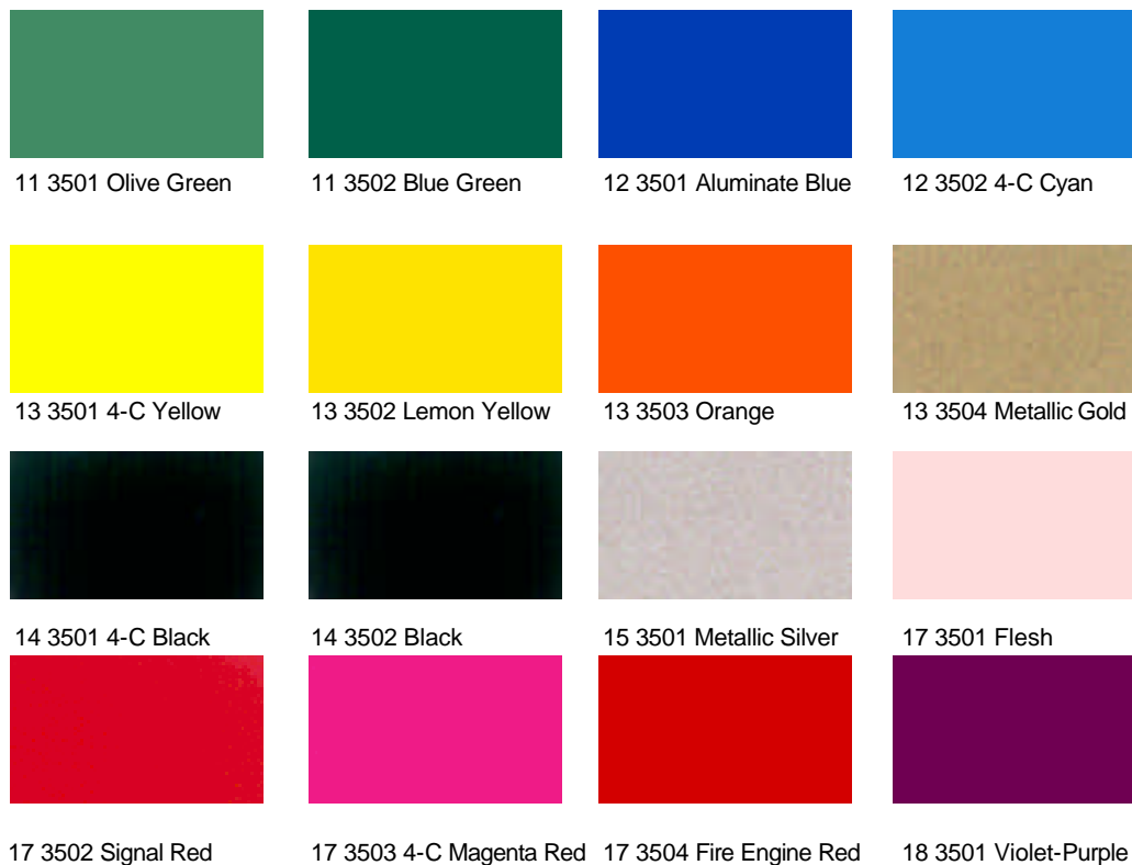
Fig. 3: Colour samples of the LT range

The information and statements contained herein are provided free of charge. They are believed to be accurate at time of publication, but Ferro makes no warranty with respect thereto, including but not limited to any results to be obtained or the infringement of any proprietary rights. Use or application of such information or statements is at user's sole discretion, without any liability on Ferro's part. Nothing herein shall be construed as a license of or recommendation for use that infringes upon any proprietary rights. All sales are subject to Ferro's General Conditions of Sale and Delivery.