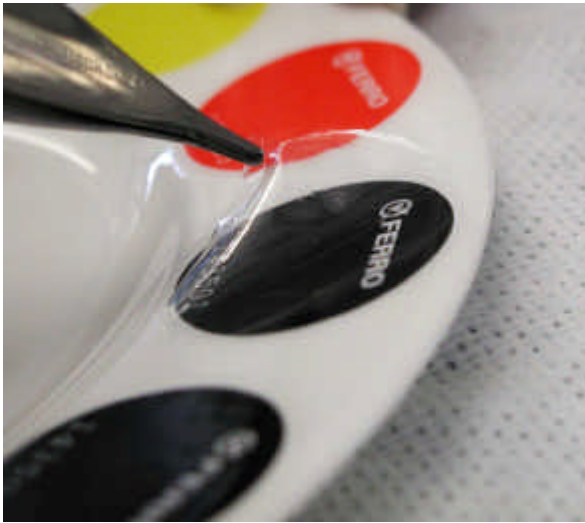
Fig. 1: Removal of the strippable coating 80 2039