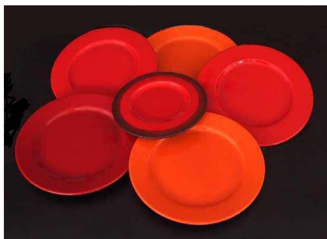
Fig. 1: Application examples

One of the advantages of the cadmium inclusion pigments is a reduced cadmium solubility compared to conventional cadmium glazes. The cadmium solubility as well as the selenium solubility of the intense pigments are below the detection limit (test in 4 % acetic acid according to DIN 1388, glaze 40-TR166).